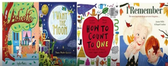
WEST SUSSEX PICTURE BOOKS TO SHOUT ABOUT! AWARD 2022-23

A form has been sent out to parents by email. If your child would like to start lessons next term, please complete the relevant form by Friday 2nd December so a timetable can be organised. Thank you.